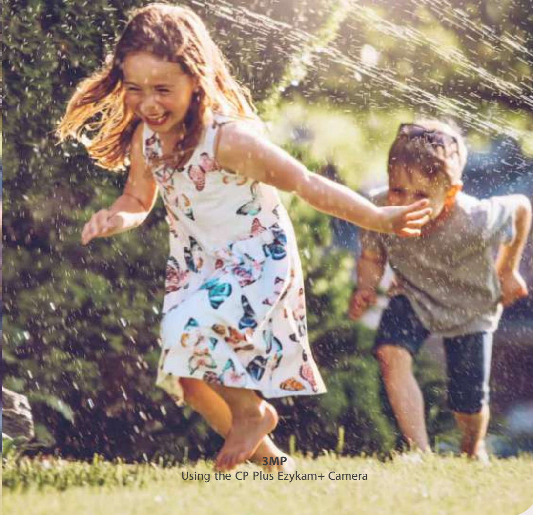
3MP Using the CP Plus Ezykam+ Camera