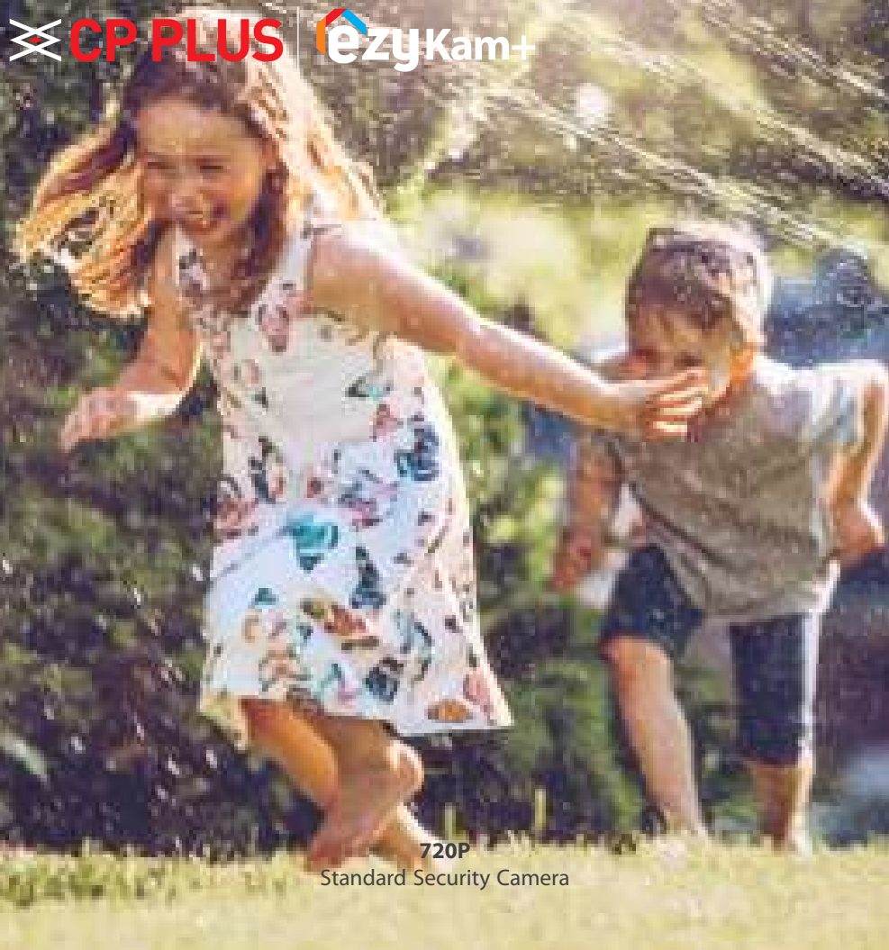
720P Standard Security Camera